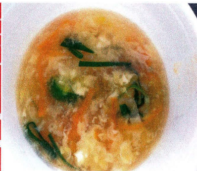
Chicken, egg and vegetable soup