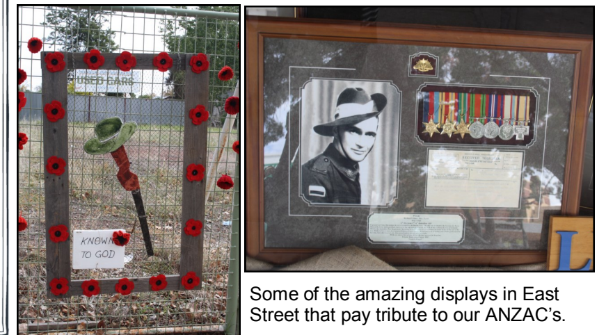
Some of the amazing displays in East Street that pay tribute to our ANZAC's.