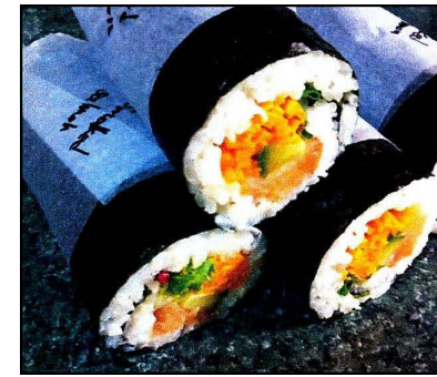
Sushi Rolls $3.50 each (All come with carrots, cucumber and lettuce)