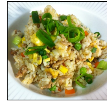
Fried Rice $3.00 (Pork Mince, carrot, peas, spring onion, egg and rice)