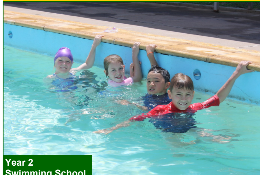
Year 2 Swimming School