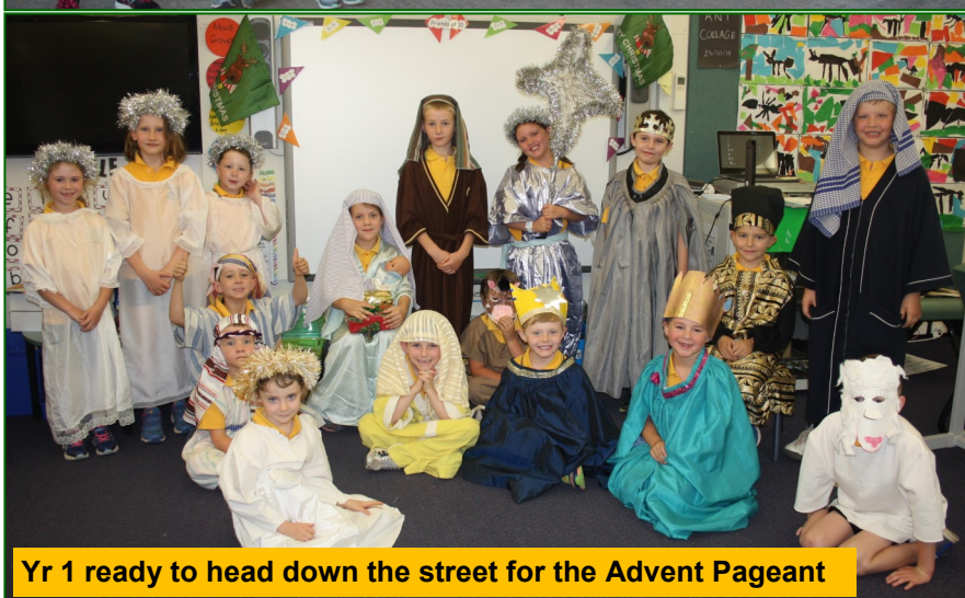
Yr 1 ready to head down the street for the Advent Pageant