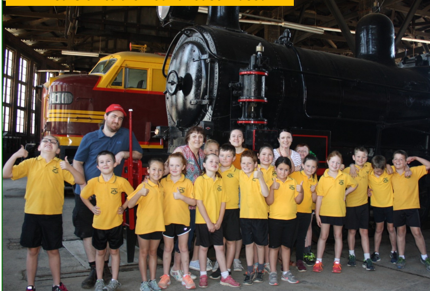
Yr 2 Excursion to the Roundhouse Museum