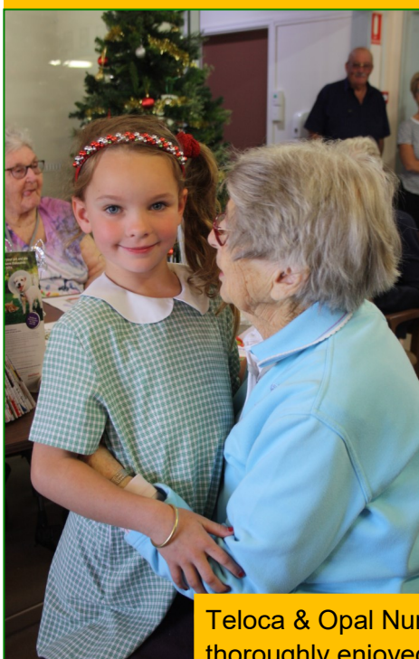
Teloca & Opal Nursing Home visit was thoroughly enjoyed by students and residents.