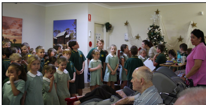
Students singing at Opal Nursing Home