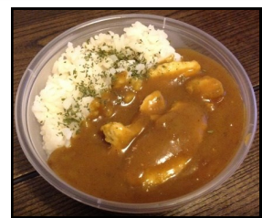
Japanese Chicken Curry & Rice $4.50